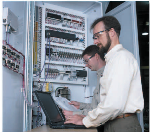
Downloading pre-tested programs into the PLC for complete package testing.