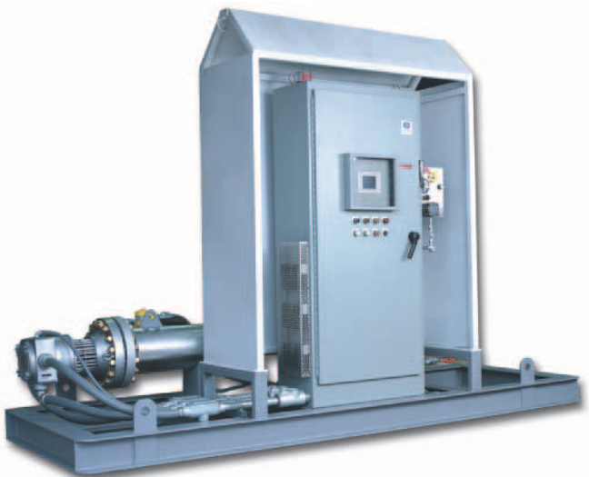
Skid mounted and pre-wired control panel.